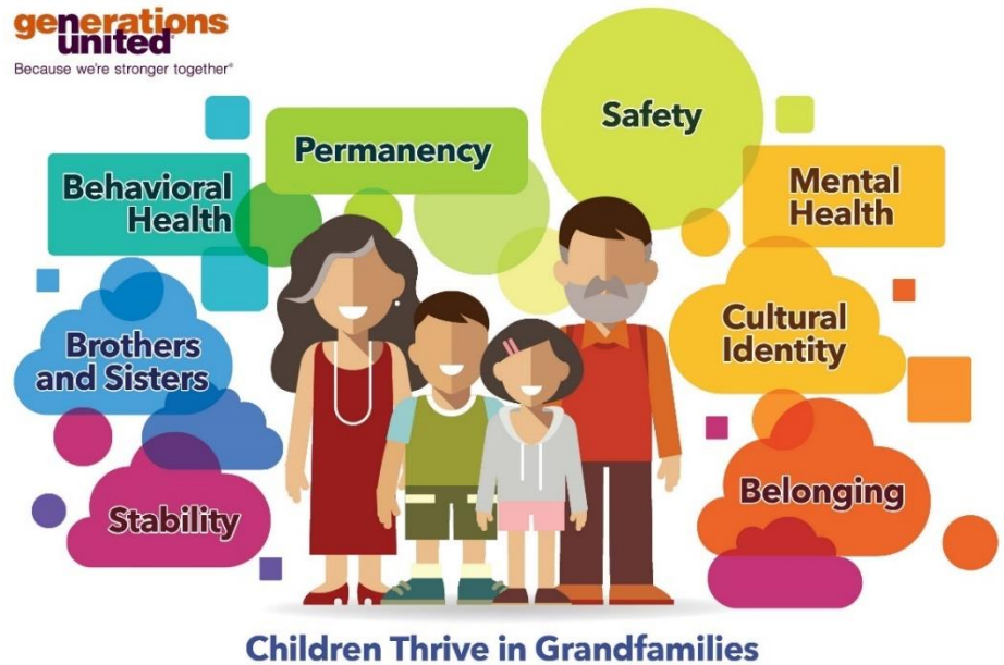
Children Thrive in Grandfamilies

Imagine you are a child. In the middle of the night, your mom drops you off at your grandma's house to live. Your mom and dad can't care for you anymore. Their opioid and alcohol use have made it impossible to parent. You're glad to be with your grandma because it feels safe and comfortable at her house, but you're worried about some things. Where will you go to school? How will you get your asthma medicine? Can your grandma get it for you? Will your mom and dad be okay?